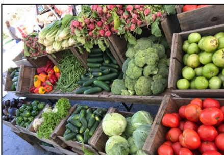
Farmer's Market at Clasky Common Park!

Open every Saturday at Clasky Common Park from 10-2pm from June-October offering a large variety of local farm fresh fruit & vegetables! Credit, Debit, SNAP, & HIP benefits accepted!