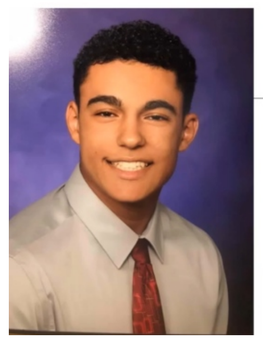
Bishop Stang photo.

Bishop Stang High School is humbled to be a part of the lives of these extraordinary young people and thanks them for their faith and service.