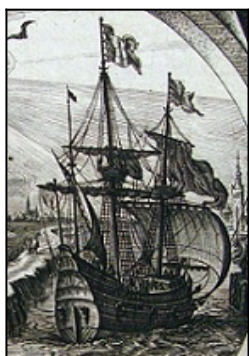
Anne and Little James