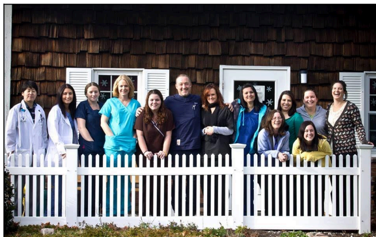
The staff at Marion Animal Hospital.

We are a 3 doctor, primarily small animal hospital seeking a