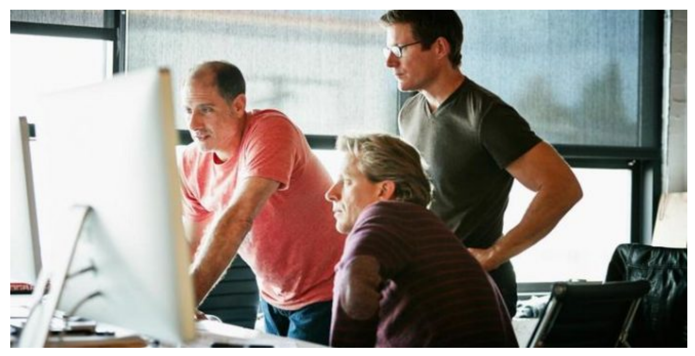
Project Coordinator (Engineering Division) - City of New