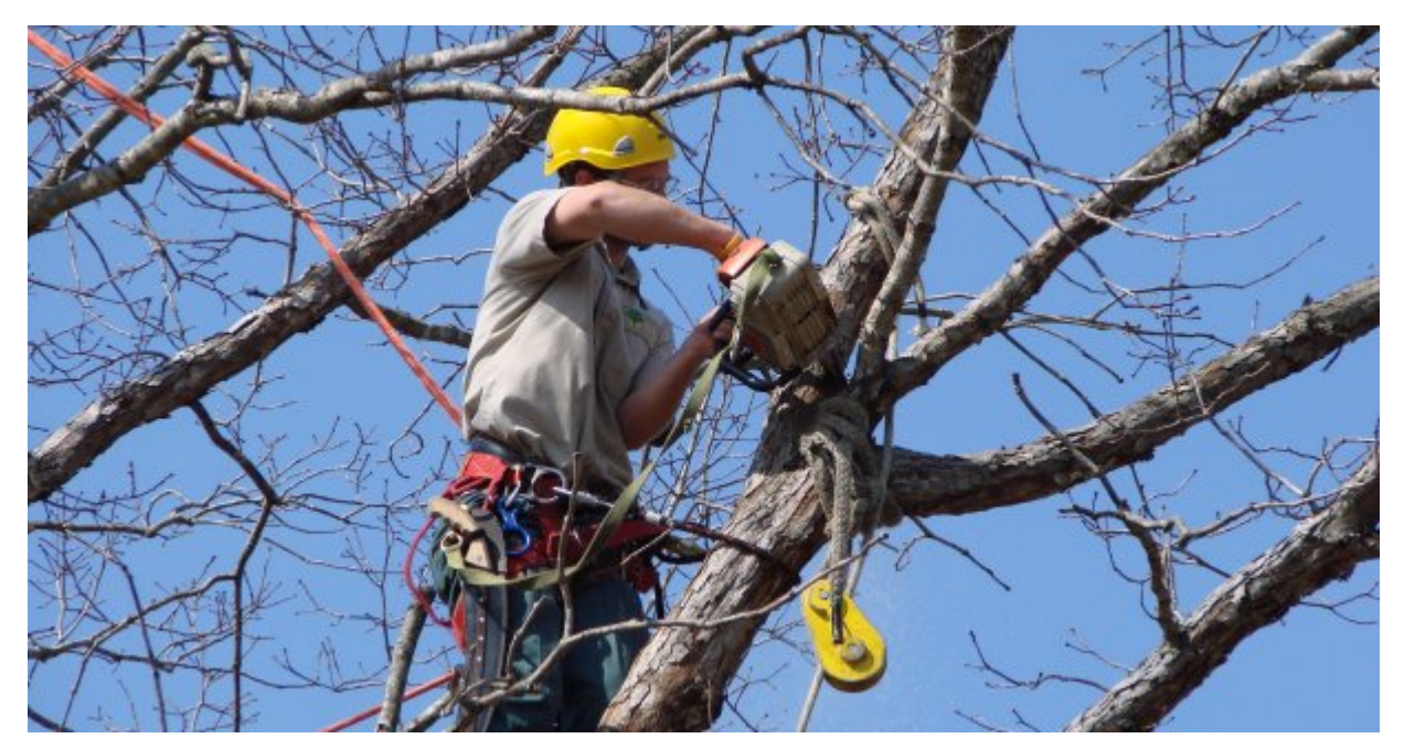
Arborist — City of New Bedford (New Bedford)

For application/complete job description, please visit www.newbedford-ma.gov or contact the Personnel Dept., 133 William St., Room 212, 508-979-1444. Applications will be accepted until a suitable candidate is found. EEO New Bedford has a residency requirement.