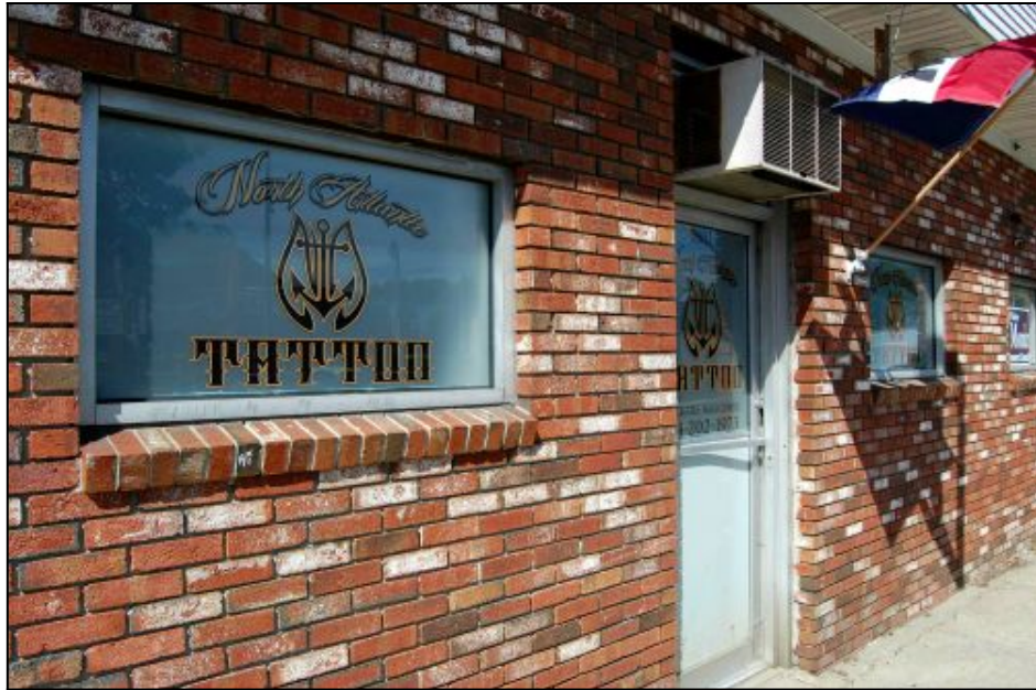
North Atlantic Tattoo at 1881 Acushnet Ave may be a new business, but the artists are industry veterans.

Tattoos and tattooing have been around since Neolithic times – at least 5,000 years. This is evidenced by the famous Ötzi the Iceman discovered in the Austrian Alps in 1991. Ötzi was roaming the earth sometime in the 4th millennium B.C.E. and had a minimum of 60 tattoos. In all likelihood, tattooing goes back much further in time, but this is the oldest known historical case of tattooing. Of course, it is part and parcel of many cultures that came after Ötzi – Teutons, Picts, Goths, Vikings, Rus, Celts, ancient Chinese, Egypt and so on. Virtually the world over.