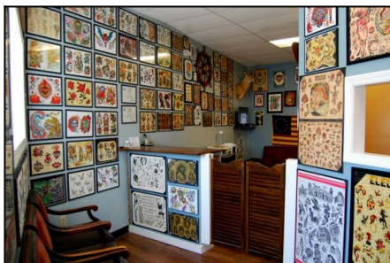
North Atlantic Tattoo's entrance, counter and custom artwork displayed on the walls.