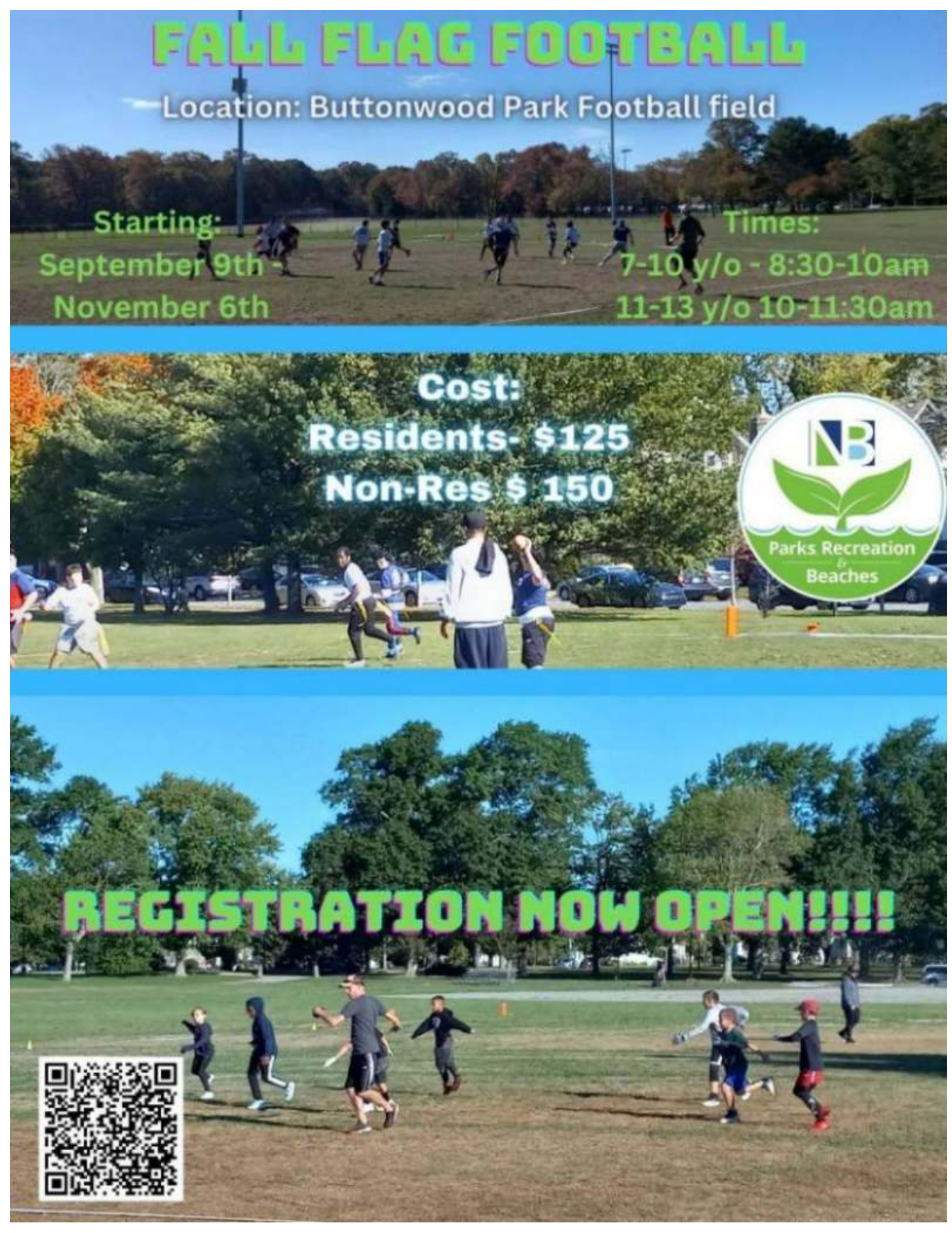
New Bedford Parks, Recreation, & Beaches photo.