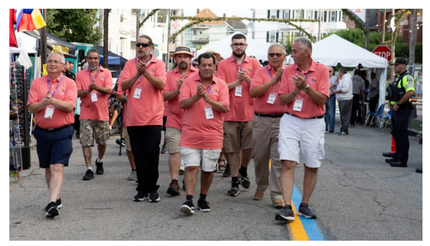
Feast of the Blessed Sacrament photo.