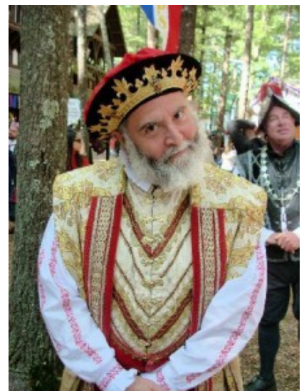
Kind Richard's Faire