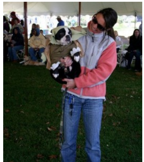
Barktoberfest is a dog friendly event!

Dust off your beer stein because Oktoberfest is here at last! What a better way to end the fall season than to drink, eat and be merry with fellow patrons under one tent. Held at Custom House Square (133 Williams St.), this is the 6th year for this event put together by the South Coast Business Alliance (SCBA). Proceeds from this event will be donated to Bristol County Children's Advocacy Center and Community Foundation. Patrons will have plenty of beer from local and regional brewers, six live bands performing, and bratwurst and sauerkraut to compliment the beer and other foods for all tastes. Tickets cost $20 dollars in advance and $25 at the door and can be purchased at Rose Alley Ale House or at Pizan's Pizza in downtown New Bedford. Anfeuerungen! It means "cheers" in German.