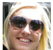
By Shonna McGrail

Downtown New Bedford will be host to one last festival before the cold weather is set upon us –Oktoberfest is here! On