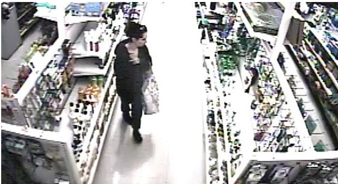
Mellisa's Pet Depot photo.

Thank you, PLEASE SHARE!"-Dartmouth Police Department.