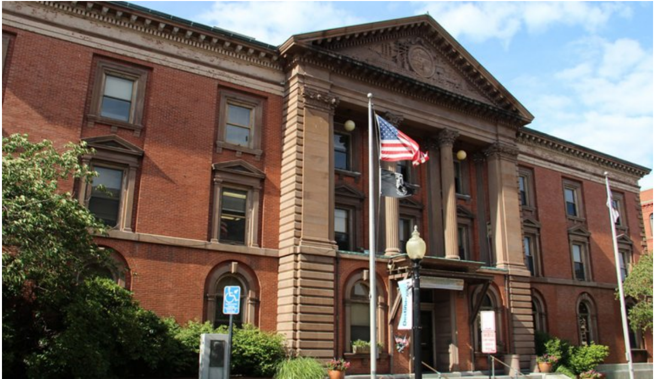
City of New Bedford photo.

Below is the original July 12th press release from the City of New Bedford detailing the agreement.