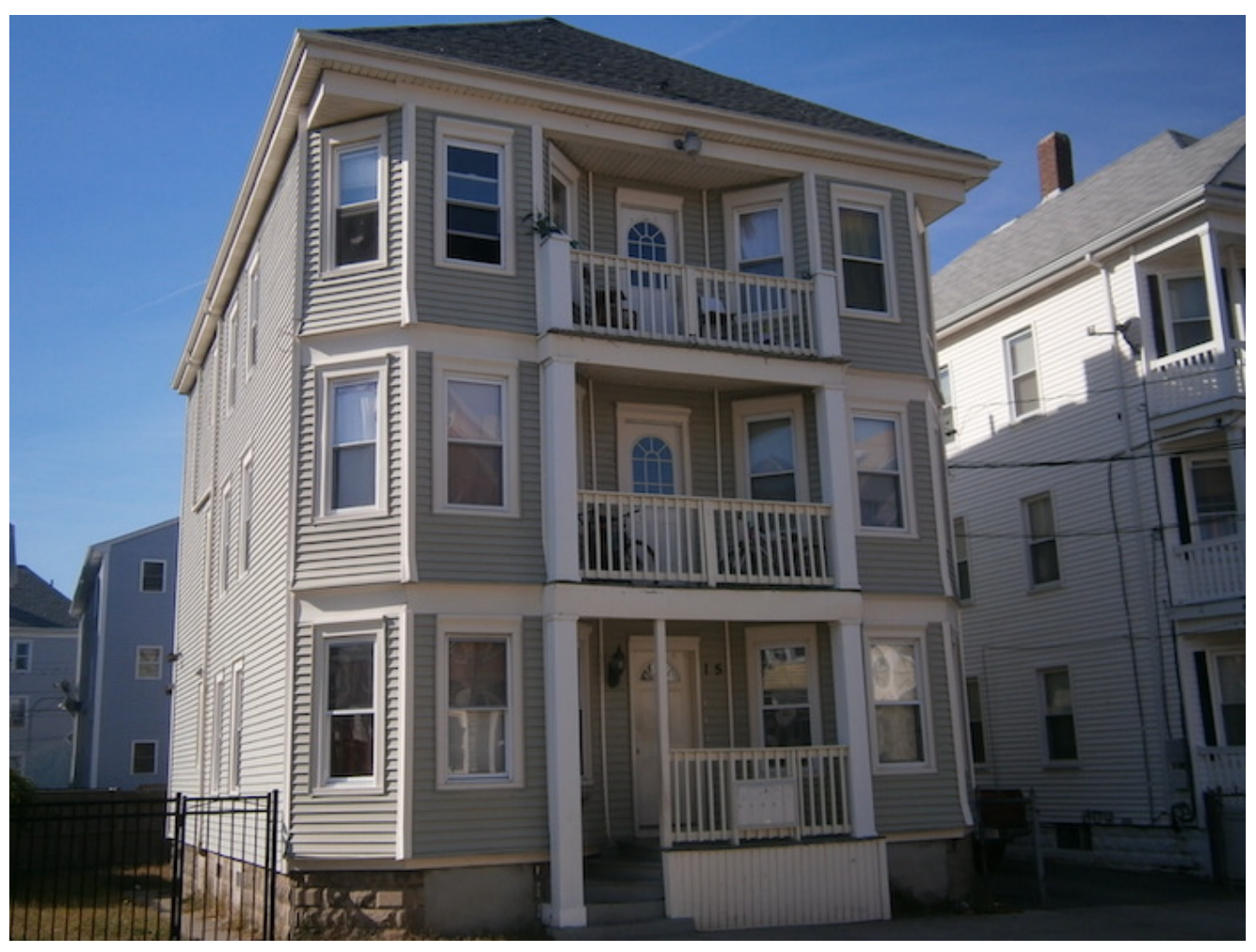
OLYMPUS DIGITAL CAMERA

Also on May 26, while targeting street-level sales of narcotics in the south end of New Bedford, detectives observed what appeared to be a narcotics transaction involving two vehicles on Frank Street off Padanaram Ave. After stopping the vehicles, detectives located more than 15 grams of fentanyl and $905.