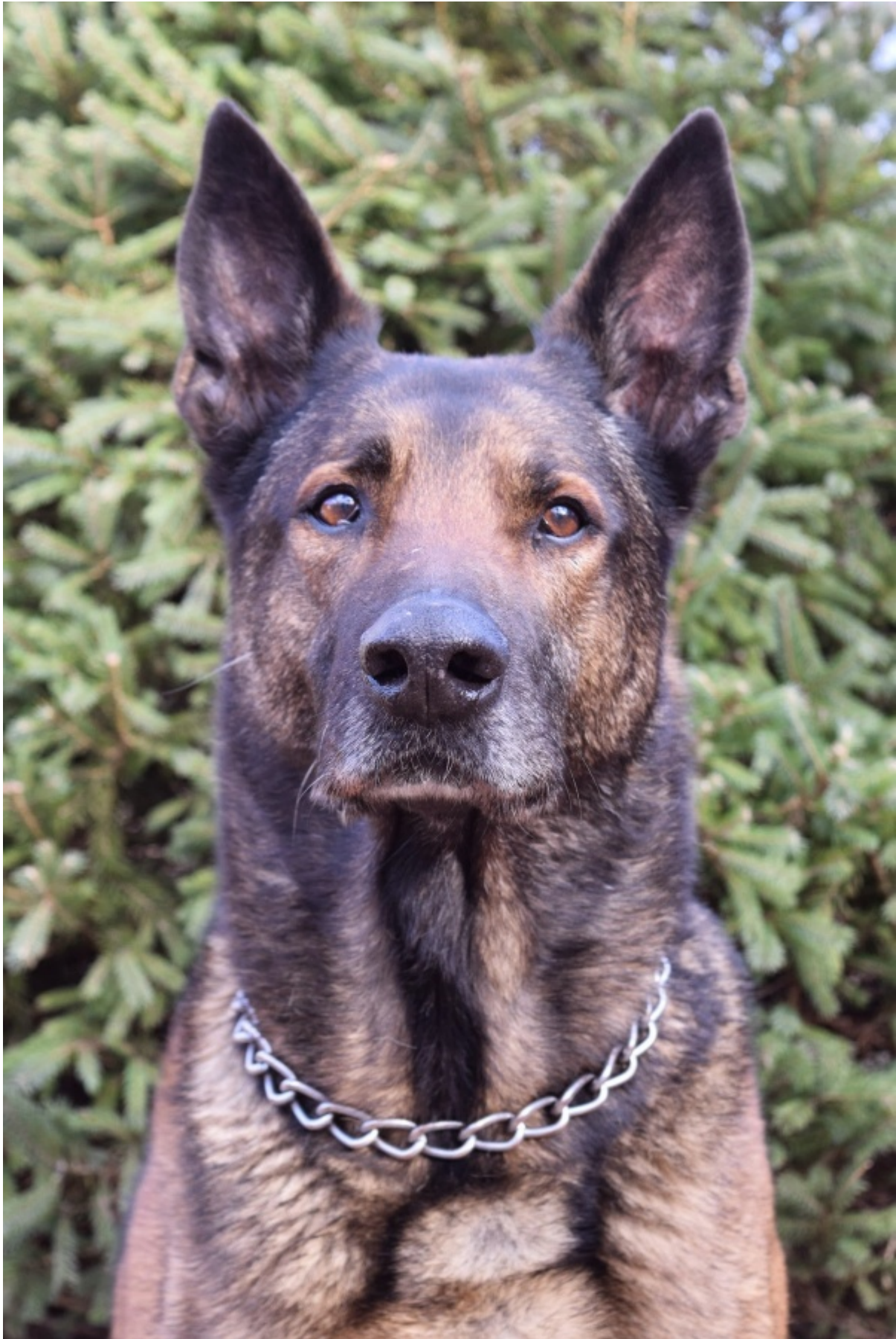
K-9 "Dozer."