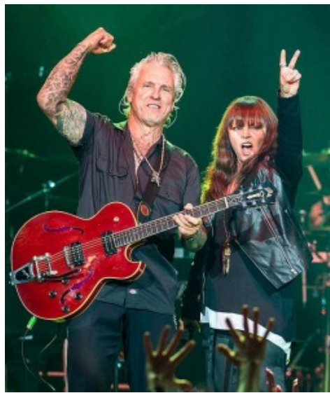
Pat Benatar & Neil Giraldo rock the Zeiterion Theatre!

Every single song was greeted by audience members leaping to their feet, singing along to every word and chanting every chorus. The night was lively and upbeat, even the security guards were dancing. The duo took a moment to recognize their own relationship with an anecdote of the first song they ever wrote about their experiences together in love, introducing "Promises in the Dark".