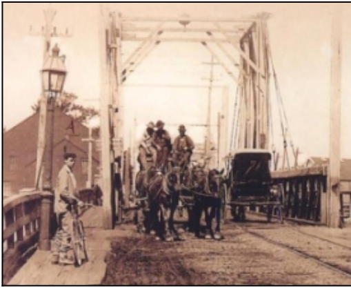
Fairhaven/New Bedford Bridge in the late 1800s

The bridge does have significant historic value; it is one of the oldest “Swing Bridges” in America still in operation. It is a beautiful bridge that accentuates both the town of Fairhaven and New Bedford. Many local historians will tell you that it is worth the 15-minute inconvenience a few times a week to have such a beautiful, piece of history that adds charm to the area. That is typically from the older generations that doesn’t drive much anymore or have way too much time on their hands.