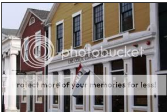
Celtic Coffee New Bedford

42 North Water Street, New Bedford, MA 02740-6335 (508) 992-1004