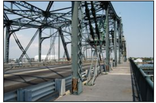
New Bedford/Fairhaven Bridge open to vehicle and foot traffic

Based on this schedule, I generally plan my Fairhaven/New Bedford bridge crossing at the second half of any hour. I do this because if the bridge closes on the hour or 15-minutes past the hour throughout the day (per the official schedule), I should never get caught at the bridge. The fact is even with a carefully thought out plan, I still get caught at the bridge at least three times a week! This is obviously due to the the bridge operators running things on their schedule vice the city's posted schedule. Dozens, if not hundreds, of citizens are inconvenienced each day thanks to a few men. Apparently, a fishing boat that can't plan their return trip on schedule is allowed to block traffic anytime they wish. If an ambulance, the police or anyone else with an emergency plans their bridge crossing based on the official schedule, they may be seriously effected by the rogue bridge operators. Since the fastest way to St. Luke's hospital from Fairhaven is to cross the bridge, this is a good possibility.