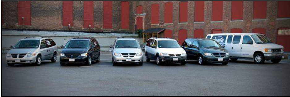
Places To Go's solid, reliable fleet of vehicles.

The biggest kicker of all, is that you get this fantastic, professional service at a rate that won't break the wallet or purse. Ed's affordable rates allow anyone and everyone to enjoy what Places To Go has to offer. Receiving a Places To Go gift certificate from a loved one will of course make it even easier to afford!