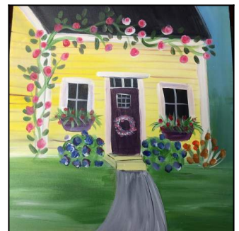
Paint images like this one at Painting With A Splash!

Boogie on down to the hits from the 70's at our Disco Dance Party on the waterfront of the Mattapoisett YMCA! Dress to impress in your retro threads & platforms or come in your favorite 70's themed character. This 21+ evening will feature a cash bar, prize for best 70's outfit, light appetizers, & disco dance lessons. Be there or be square! Proceeds will benefit the Gleason Family YMCA & Mattapoisett YMCA Annual Campaign, which provides financial assistance to families that could otherwise not afford membership or programs. Tickets available at the Gleason Family YMCA and Mattapoisett YMCA or online at ymcasouthcoast.org . Tickets may also be purchased at the door on the night of the event. Phone: 508-295-9622. Email: clongfield@ymcasouthcoast.org .