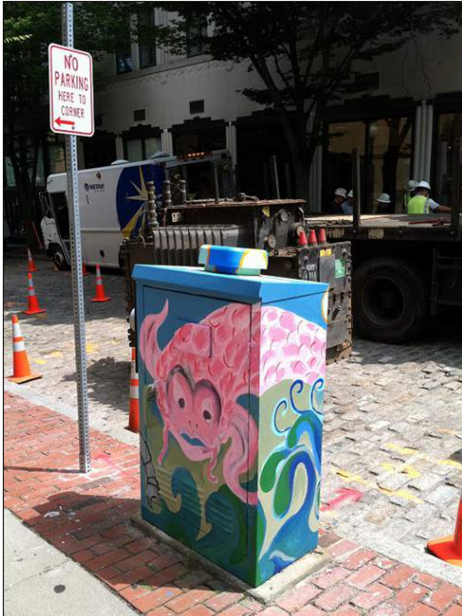
One of the finished commissioned electrical boxes