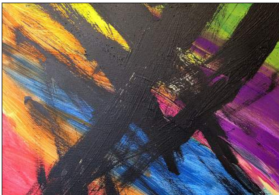
Contribution from one of Buttonwood Zoo’s Elephants!

The animals at the Buttonwood Park Zoo have been busy beavers – literally! Not sure if you have taken up any new hobbies this winter to help pass the time until spring arrives, but