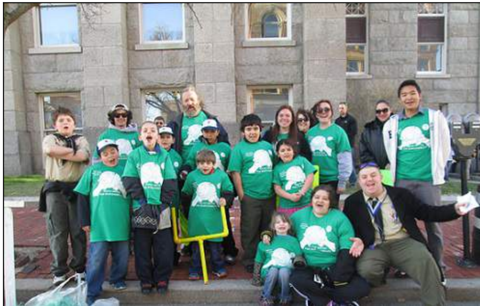
Great job Cub Scout Pack 7!