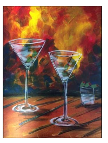
Have a blast painting "Martini Date" at Painting w/ a Splash!

generous sponsors Freitas Package Store, Miller Lite, Colonial Wholesale Beverage. There will be no parking on City Pier tonight (except for handicap parking) Parking in the downtown area and Elm St. Garage is recommended.