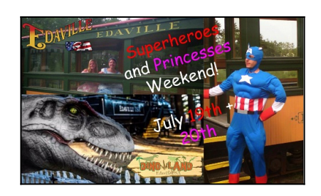
Two days of Princes and Princesses…and getting treated like one!