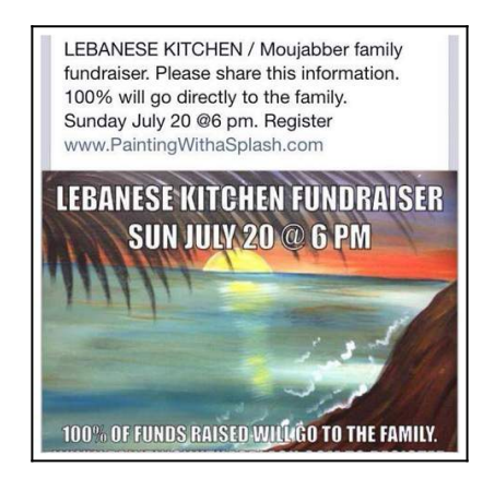
Have fun and support a local cause!

The Silverbrook Country Store is the home of The Pereia Bread Co. (a tasty little division of Silverbrook Farm) where they make their Famous Pies and Breads, as well as jams, sauces and other great food products.