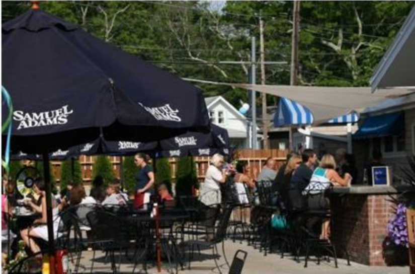
The Wave Restuarant and Bar outdoor patio – Marion, MA

Gateway Tavern & Grille: 371 Marion Road, Wareham, MA 02571. (508) 291-6040.