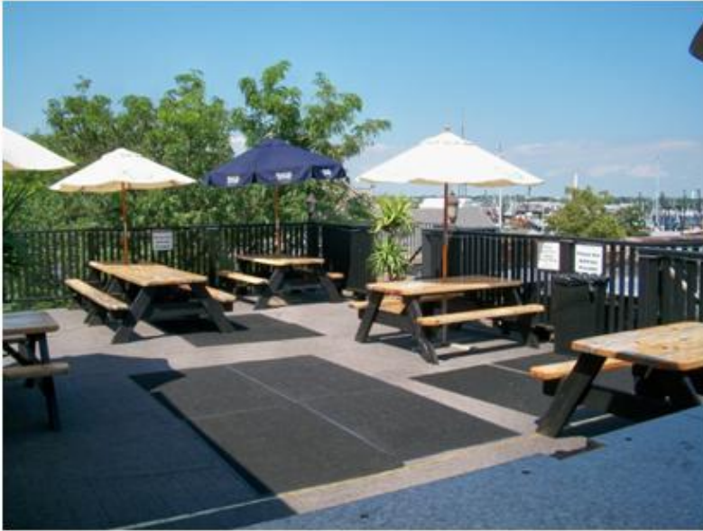
Catwalk Bar and Grill roof top patio – New Bedford, MA

Candleworks Restaurant: 72 North Water Street, New Bedford, MA 02740. (508) 997-1294. www.thecandleworksrestaurant.com (0.3 miles)