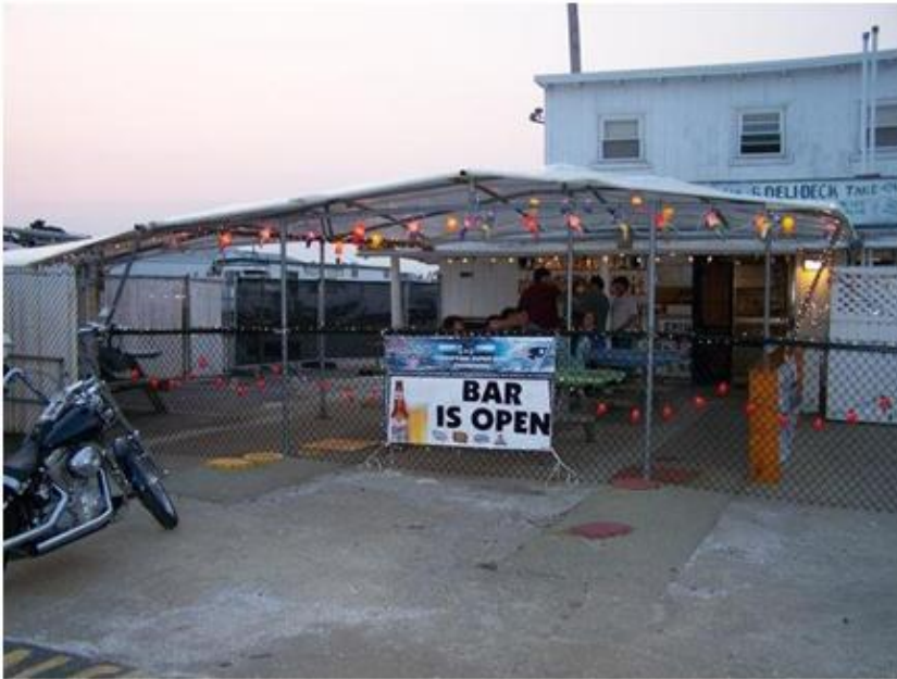
Down the Hatch Bar – Fairhaven, MA

Turks Seafood: 83 Marion Road, Mattapoisett, MA 02739. (508) 758-3113.