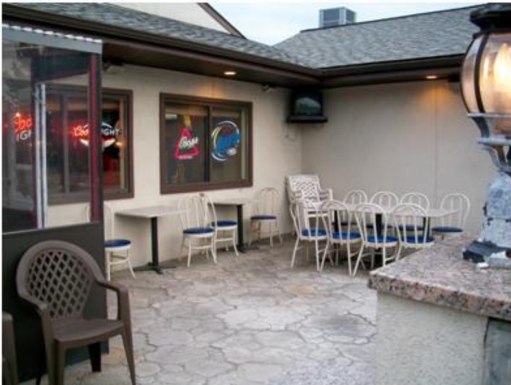
Wasabi Sushi – Dartmouth, MA

Good sushi and Asian cuisine with a very large menu, Sadly, Wasabi has a very small (and underused) outdoor deck/patio area. Click here for driving directions.