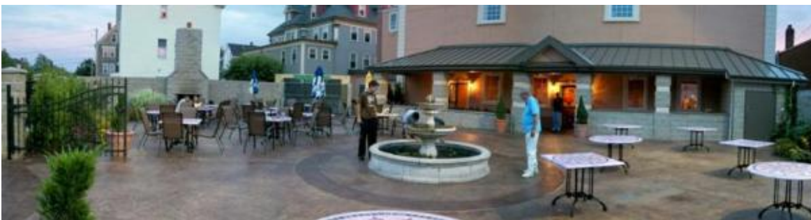
Cotali Mar Restaurante – New Bedford, MA

Cotali Mar Restaurante is the only place on this list that I haven't been a customer at, but after visiting it I was truly taken back. The outdoor area is beautiful and the largest outdoor bar area that I've seen in New Bedford. There's a bar located outdoors (that seems to be open only on the weekends) and a fire place at one end. I've never had the food at Cotali Mar, but when I talked to customers I knew eating outside they insisted that the food was "really good." Cotali Mar Restaurante looks amazing and has a beautiful outdoor dining and drinking area. Click here for driving directions.