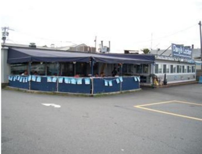
Davy's Locker – New Bedford, MA

Davy's Locker has been voted best seafood 11 years in a row and has two outdoor seating areas. There is a covered area attached to the main building, so you'll be protected from the elements. Approximately 50 yards from the main building is the famous Tiki Hutt and is located directly on the water. The Tiki Hutt is truly a place to hang out and get the most of those summer rays. Davy's Locker and Tiki Hutt are motorcycle friendly with private motorcycle parking spots. The bars are located right next to New Bedford's south end beaches and historic Fort Taber. Click here for driving directions.