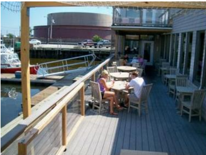
Waterfront Grille outdoor patio – New Bedford, MA

You can't get much closer to the Fairfield Inn than this! The Waterfront Grille is conveniently located almost directly out the Marriot's front door and has quality food and drinks. Visitors can enjoy the wonderful summer time air on one of the two outdoor patio areas. Sit back with some refreshing drinks and enjoy the boating traffic that makes New Bedford's fishing port the busiest in the country. Waterfront Grille has entertainment on Fridays and Saturdays, and Patio Parties and brunch on Sundays. Click here for walking directions (or just walk out the front door of the Fairfield Inn).