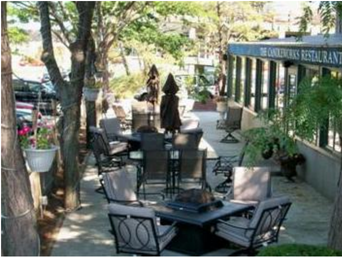
Candleworks Restuarant – New Bedford, MA

Cotali Mar Restaurante: 1178 Acushnet Avenue, New Bedford, MA 02746. (508) 990-0066 www.cotalimarrestaurante.com (1.8 miles)