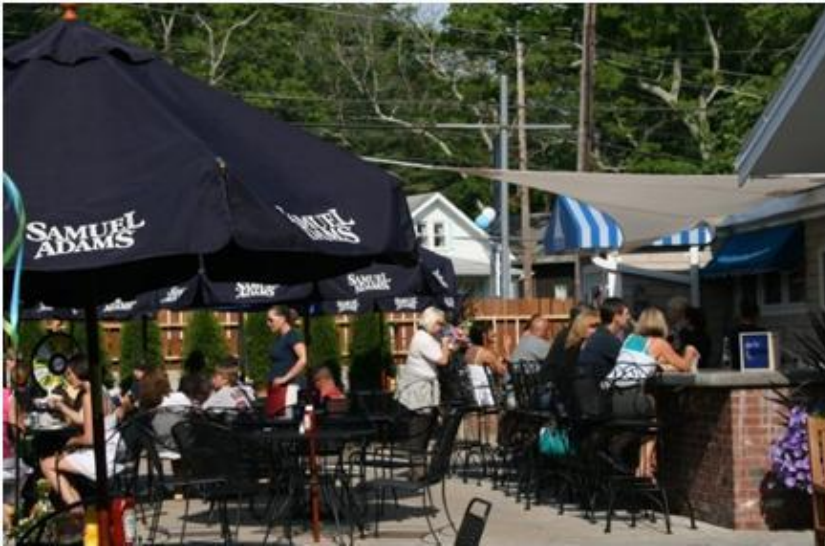
The Wave Restuarant and Bar outdoor patio – Marion, MA

Gateway Tavern & Grille: 371 Marion Road, Wareham, MA 02571. (508) 291-6040.