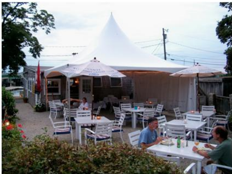
Black Bass Bar and Grille outdoor patio – Dartmouth, MA

area. Plastic chairs and tables that rest on crushed white shells and covered by a white tent, allow patrons the chance to enjoy the outdoors and relax with an almost beach like feeling. Click here for driving directions. While you're there make sure you take the time to walk around and take in this neat little town.