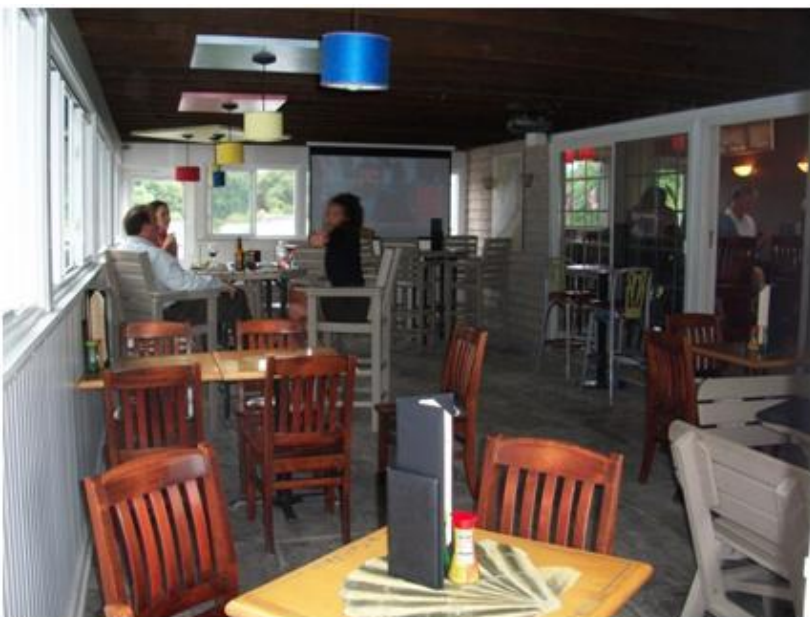
Turks Seafood and Bar – Mattapoisett, MA

Turks Seafood in Mattapoisett, has absolutely the freshest sushi and seafood around with a great indoor/outdoor patio. This great little establishment also has live entertainment on Monday nights. Click here for driving directions.