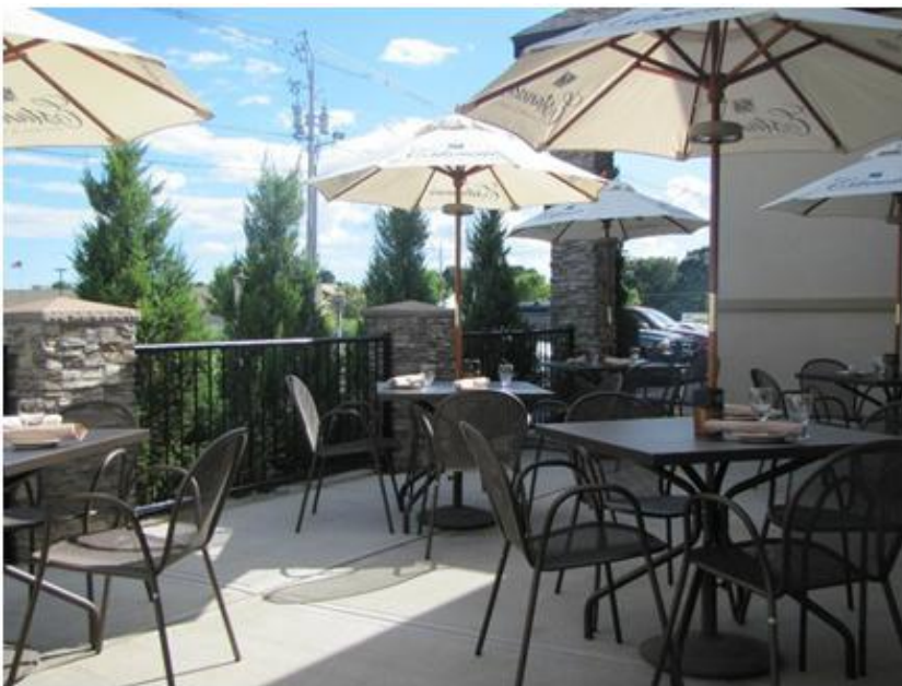
The Pasta House in Fairhaven, MA

Fairly new to the outside dining patio club is the Pasta House in Fairhaven. The restaurant has great home-made pasta, food specials, and great drinks that you can enjoy on their outdoor patio. The umbrellas provide shade and make this spot even more attractive. Business casual dining, is the best way to describe the atmosphere at The Pasta House. Whether you're out with family and friends or just flyin' solo, you'll feel comfortable and at home on The Pasta House patio. Click here for driving directions.