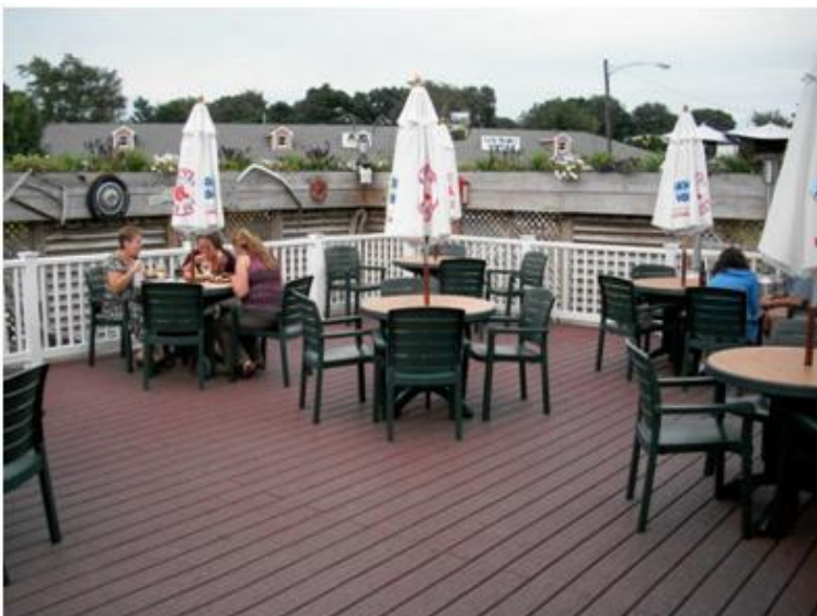
Ice Chest Bar outdoor patio –

The Ice Chest is one of the areas busiest bar and grilles. It's a fun bar that serves great food. The Ice Chest provides a wonderful outside deck patio located directly off the main bar room where you can enjoy ice cold beer, great food specials every day, live entertainment and nothing is overpriced. The Ice Chest is extremely biker friendly. Click here for driving directions.