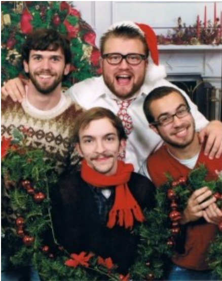
Christmas with the Lesser Knowns