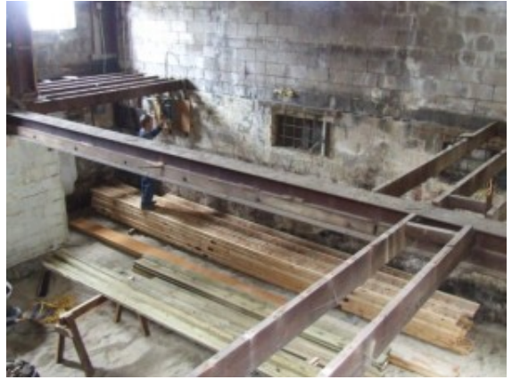
Rose Alley Ale House during renovations.

The building in which RAAH is located was previously called the Cultivator Club, and looked much different than it does now. What was the process like for transforming the building into what we see today?