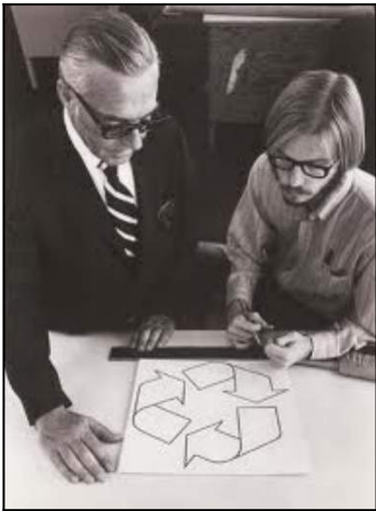
The three-arrow recycling symbol

door, and scavenged dump sites in search of sources of metal. By the time the First World War started, American cities were swarming with thousands of such peddlers.