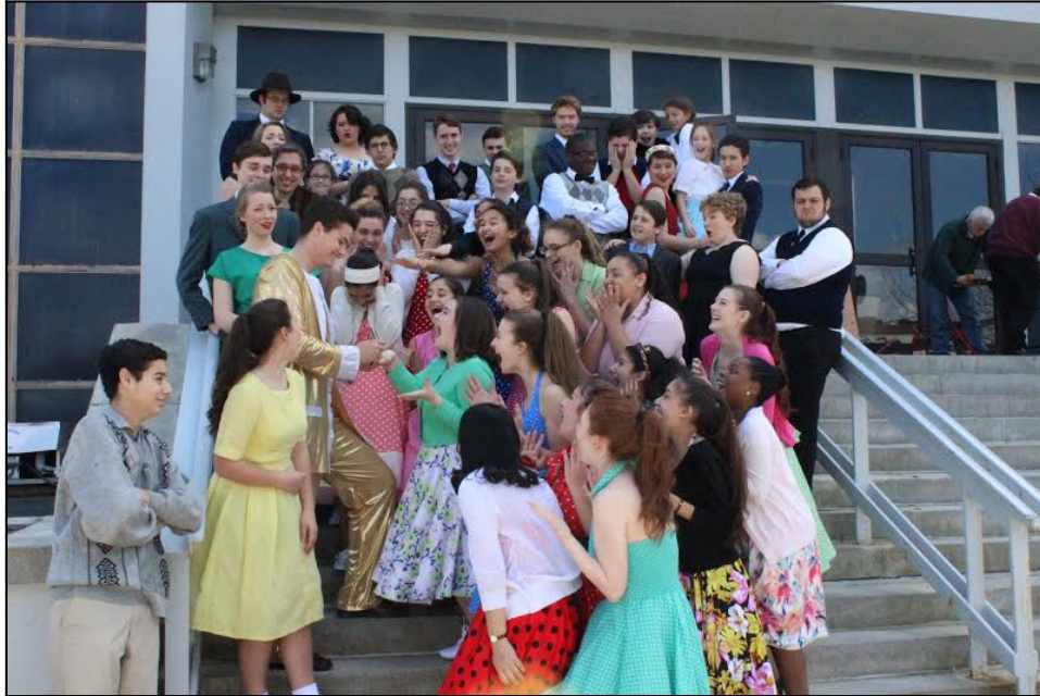
Superstar Conrad Birdie and his adoring fans.

The story revolves around rock 'n' roll superstar Conrad Birdie (loosely based on Elvis Presley), who, to the dismay of his adoring fans, is about to be drafted into the Army. Featuring a book by Michael Stewart, music by Charles Strouse, and lyrics by Lee Adams, comic complications ensue when, as part of one last publicity stunt cooked up by his agent, he promises to give a good-bye kiss to one lucky girl from Sweet Apple, Ohio, on "The Ed Sullivan Show." The upbeat score features "How Lovely To Be a Woman," "The Telephone Hour," "Put On A Happy Face," "A Lot of Livin' To Do" and "One Last Kiss."