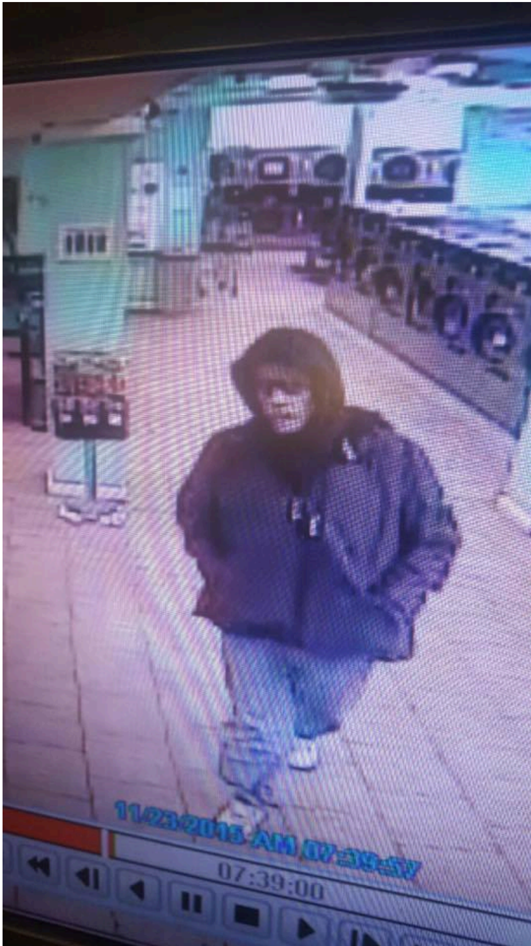
Wash World, New Bedford surveillance photo.