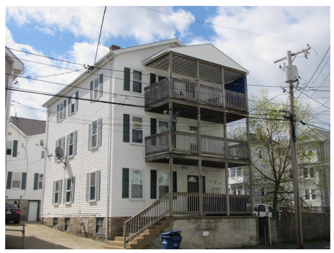
893 County Street, New Bedford MA

On June 2, New Bedford police officers seized 58 grams of cocaine and almost $14,000 at 893 County St. #2. 40-year old Angel Rivera of 893 County St. #2 was charged with trafficking. Rivera was previously arrested and charged for trafficking in January. Detective Tim Soares investigated the case.