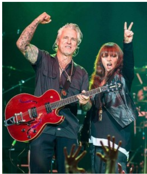
Pat Benatar & Neil Giraldo rock the Zeiterion Theatre!

Every single song was greeted by audience members leaping to their feet, singing along to every word and chanting every chorus. The night was lively and upbeat, even the security guards were dancing. The duo took a moment to recognize their own relationship with an anecdote of the first song they ever wrote about their experiences together in love, introducing “Promises in the Dark”.