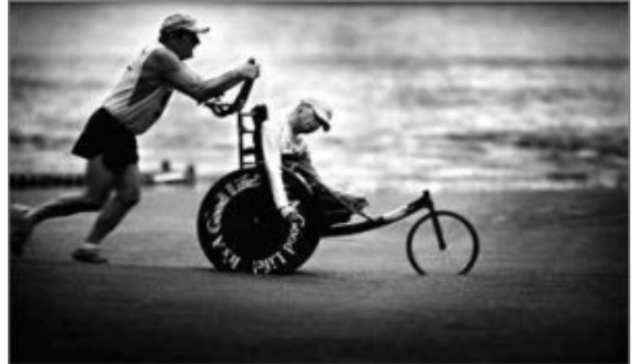
Dick and Rick Hoyt

Team Hoyt is an inspirational story of a father, Dick Hoyt, and his son Rick, who compete together in marathons and triathlons across the country. Together Team Hoyt (facebook) founded The Hoyt Foundation, an organization that strives to help those who are physically disabled become active members of the community. I am asking you and your community to join us in spreading The Hoyt Foundation's message: "Yes You Can!"