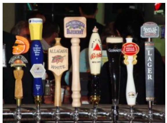
A selection of beer on tap at Rose Alley.