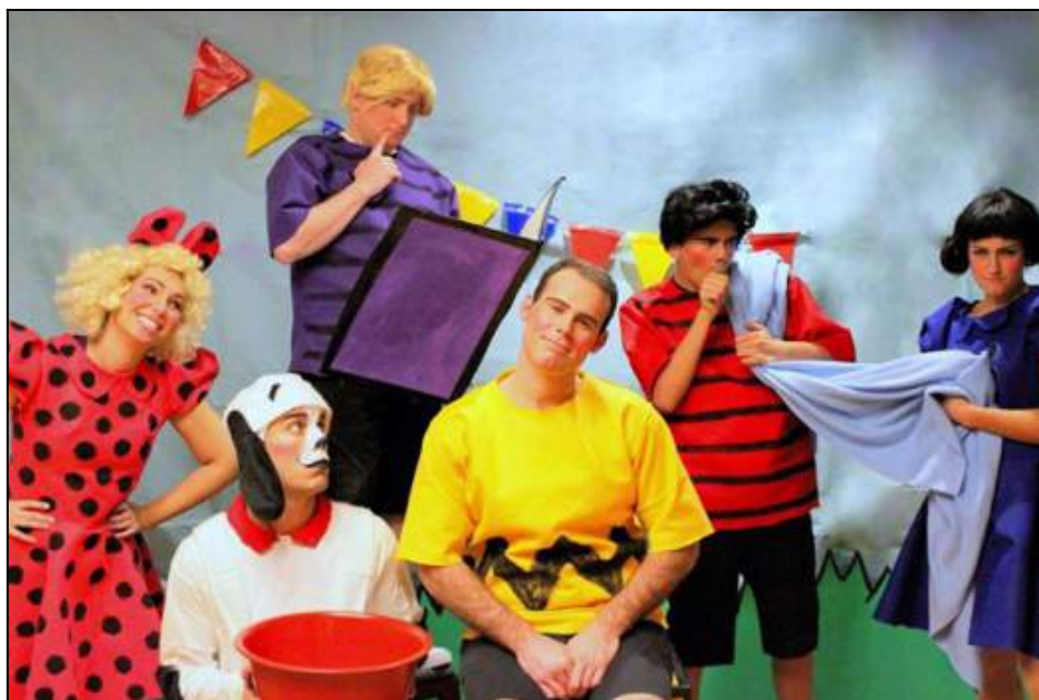
The talented cast of ‘You’re a Good Man, Charlie Brown’!

ONE Theater Group is proud to announce its upcoming production of “You’re a Good Man, Charlie Brown.” The show is fun and entertaining for all ages, but it also serves a very important purpose – all of the proceeds will be donated to the Alzheimer’s Association.