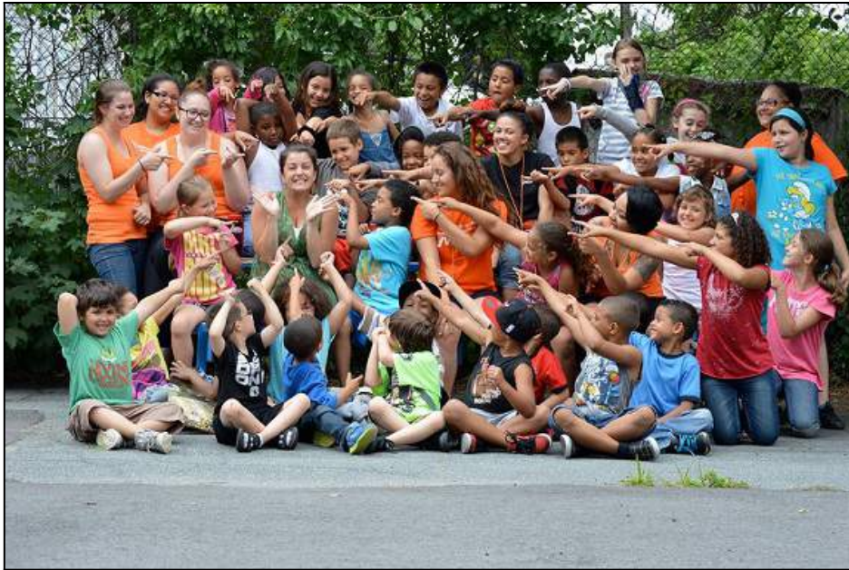
The YWkids School Age Program: putting smiles on kid's faces for more than 25 years!

For more than 25 years, the YWkids School Age Program has fulfilled a big need among local families – quality care for their children. The program, offered by the YWCA of Southeastern Massachusetts, provides after-school care as well as a full-day summer program to school age children (ages 5-14) of New Bedford.