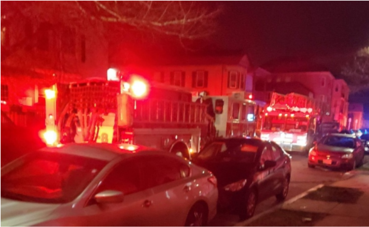
Kendra Stevenson Frederic photo.