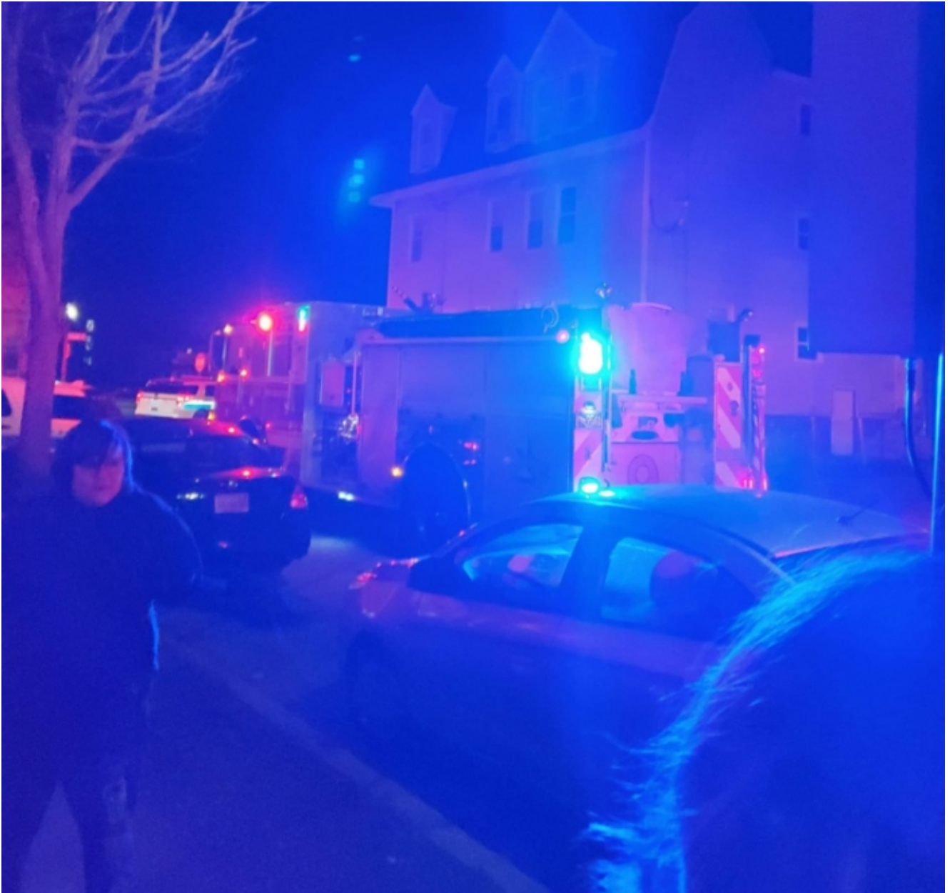
Kendra Stevenson Frederic photo.