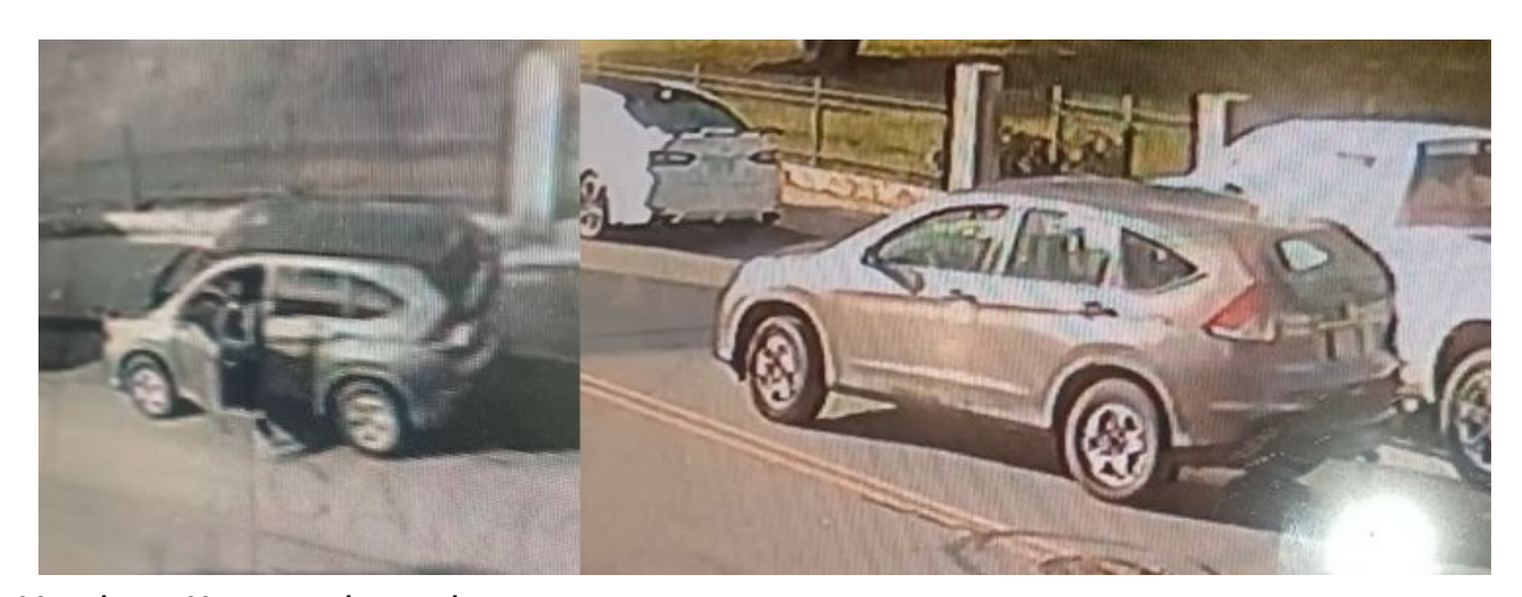
Here is a bigger picture of the dog: