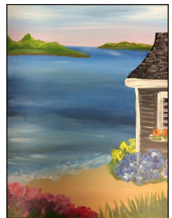
Paint "Summer Cottage" at Painting w/ A Splash!