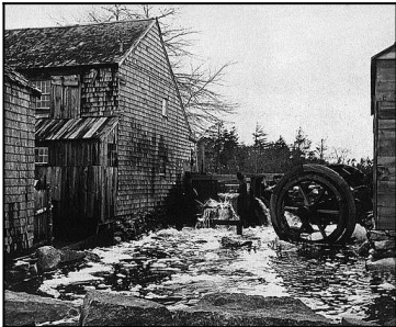
Old Cummings grist mill

of shoes, one iron pot, and ten shillings..." Though made official in November, the land was unofficially purchased 6 months prior on March 7. While the exchange seems like a pittance, these things were incredibly valuable to the Wampanoags.