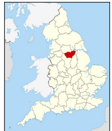
Map of England, showing the region where the Topham surname emanated from: South Yorkshire. (Nilfanion)

Etymologically speaking, the word “Topham” is a compound of “top” and “ham.” “Ham” is a diminutive of hamlet, which is defined as “...a small settlement, generally one smaller than a village.” These hamlets or hams were unincorporated dwellings on the outskirts of town – people out in the “boonies.” These communities weren’t large enough for a church, so were parts of a parish.