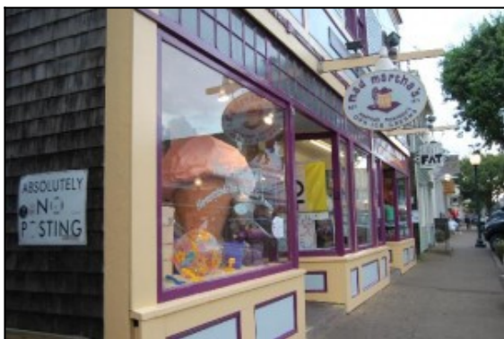
Mad Martha's Ice Cream, on Circuit Avenue.

After dinner comes desert for us, so we head over to Circuit Avenue where there are many ice cream shops to choose from. The most famous is Mad Martha's , but there is also Ben and Bill's Chocolate Emporium and the Carousal . All of them are great and the portions are huge, but they are pricey: You can expect to pay about $4.00 or more for a cone. Since I don't have a favorite ice cream shop, I go to the one with the smallest line. This is important because during the summer the lines can be out the door.