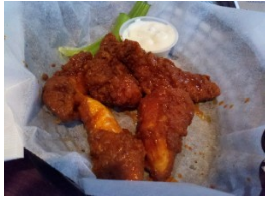
Medium-spicy buffalo wings.

Considering Rose Ally is a pub, the menu had a large selection of food to choose from. They offer appetizers, soups and salads, wraps, panini's, even entrées consisting of things like steak tips, stir fry's, surf n turf and friend seafood, all with great prices. A kid's menu is available with reasonable choices for $3.99 each. There were only two dessert offerings but with the huge beer selection, who needs dessert? If you're up for a food challenge like on Man vs. Food, they offer the San Juan Challenge: How many suicidal wings can you eat in 20 minutes? Suicidal is the hottest sauce they have, so don't accept this challenge if you can't take the heat. If you beat the current record, your picture will be put on the Wall of Fame. Any takers?