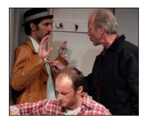
The One Minute Play Festival takes place on Saturday an Sunday!