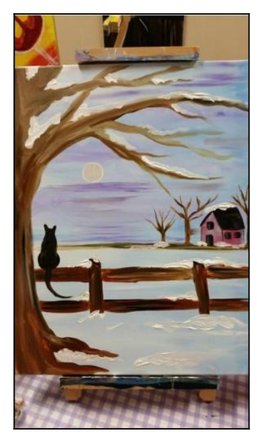
Have fun paining "Cat on a Fence"

Each Saturday in January and February, you can take a storybook walk with your family at a local conservation areas. The Coalition and the Wareham Land Trust will set up a new story each weekend that embraces the beauty of winter. Visit one of these places anytime between dawn and dusk to go on a self-guided family adventure. FREE. Registration is required for all Bay Adventures. To RSVP: Phone-(508) 999-6363 ext. 219 or Email: bayadventures@savebuzzardsbay.org.