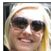
By Shonna McGrail

It's safe to say that we all look forward to the weekends, but sometimes routines can get a bit monotonous. Going to the same bar with the same crowd every Friday night provides a sense of comfort but it can get old fast. If you're looking for something new to do in Greater New Bedford area, consider checking out one of these five locations for live local music.