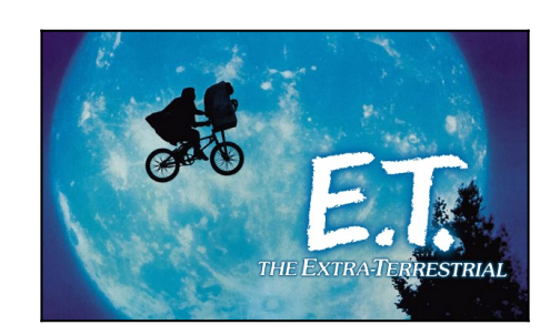
The Zeiterion is THE spot to be on Sunday with a BUNCH of activities.

The Salem Food Truck Festival is back! Bigger and Better, this year the festival will feature 40 of the area's top food trucks! Held at the Salem Common in historic downtown Salem, Ma. We are excited to offer fellow food lovers the regions top food trucks, live music and family fun and it's FREE! With a range from grilled cheese to whoopie pies, there is sure to be something for everyone! Save the dates and save your appetite for the area's biggest food truck event! Salem Common Historic District.