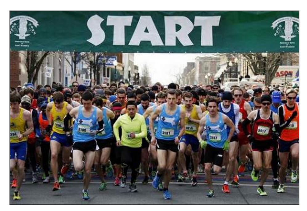
New Bedford Ready to Host 37th Annual Half Marathon Race Begins at 11:00 a.m. Sharp on Sunday, March 16, 2014

On Sunday, March 16, 2014, thousands of runners will participate in the 37th Annual New Bedford Half Marathon. The race is hosted by the Friendly Sons of St. Patrick, a New Bedford based fraternal organization, and the City of New Bedford. The course is a challenging one that includes two major hills, waterfront views, and will be lined with hundreds of volunteers and cheering fans.