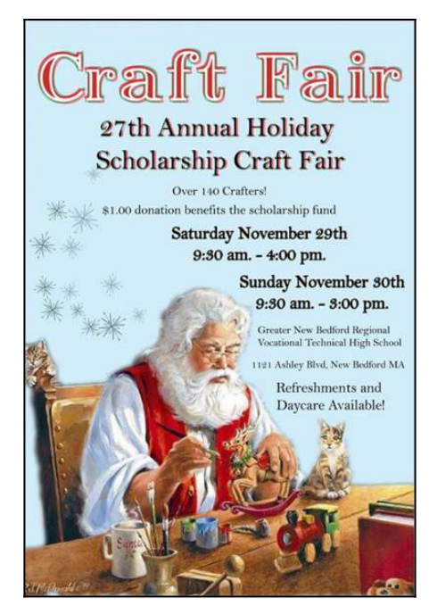
27 years and running!