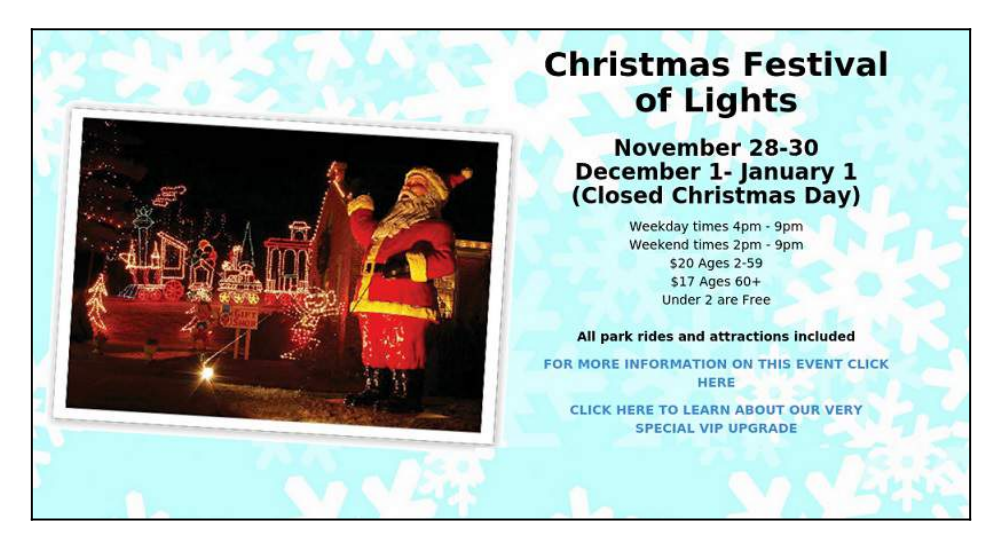
It's that time of year!

Edaville's Christmas Festival of Lights is arguably the most-loved festival of its kind, having earned generations of loyal fans. Passengers relax comfortably in warm and dry coaches while riding through a spectacular holiday setting featuring an explosion of lights. Kids of all ages will enjoy an array of vintage amusement rides and a visit with Santa in one of our indoor play areas. Stay for a delicious full meal or enjoy seasonal treats while roaming our sprawling and beautifully decorated grounds featuring thousands of Christmas displays. For more info and/or tickets, click on event title.