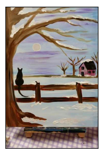
Have fun painting "Cat On A Fence" at Painting w/ a Splash!

Edaville's Christmas Festival of Lights is arguably the most-loved festival of its kind, having earned generations of loyal fans. Passengers relax comfortably in warm and dry coaches while riding through a spectacular holiday setting featuring an explosion of lights. Kids of all ages will enjoy an array of vintage amusement rides and a visit with Santa in one of our indoor play areas. Stay for a delicious full meal or enjoy seasonal treats while roaming our sprawling and beautifully decorated grounds featuring thousands of Christmas displays. For more info and/or tickets, click on event title.