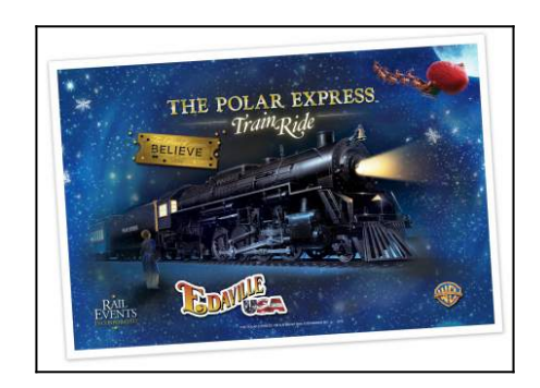
Polar Express Ride and XMas Festival of Lights at Edaville USA!

Edaville's Christmas Festival of Lights is arguably the most-loved festival of its kind, having earned generations of loyal fans. Passengers relax comfortably in warm and dry coaches while riding through a spectacular holiday setting featuring an explosion of lights. Kids of all ages will enjoy an array of vintage amusement rides and a visit with Santa in one of our indoor play areas. Stay for a delicious full meal or enjoy seasonal treats while roaming our sprawling and beautifully decorated grounds featuring thousands of Christmas displays.