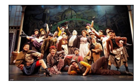
Don't miss the final performances of the New Bedford Festival Theatre's "My Fair Lady" this weekend at the Zeiterion.

all American music festivals. That influence continues today, serving the fans who crave innovation but appreciate tradition. Join us for this year's Festival in Newport Rhode Island held July 28-29, 2017. For ticketing information and payment plan details, please visit http://www.newportfolk.org/tickets. Fort Adams, Newport, RI.