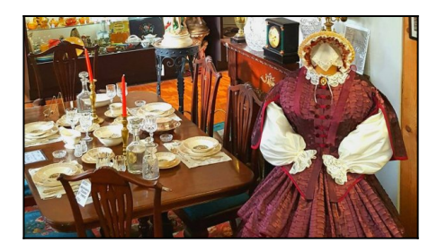
Find some local treasures at New Bedford Antiques at Wamsutta Place this weekend!