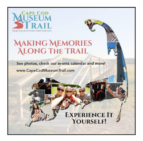
There are dozens of exciting and interesting museums to visit on the Cape Cod Museum Trail this weekend!