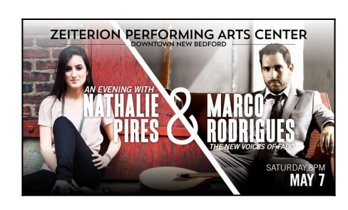
Enjoy live music? Ever been to see Fado live? You'll have a chance on Saturday evening.