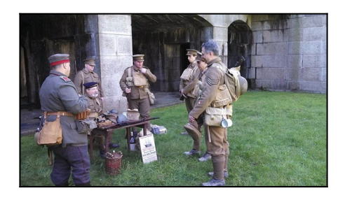
A fan of WWI history? Check out the 3rd annual WWI Encampment on Saturday and Sunday.