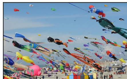
4th Annual Onset Beach Kite Festival!

Join us every Saturday at 11am at the Main Library Children's Room for Family Story Time. Great for all ages! Hope to see you there! New Bedford Free Public Library, 745 Rockdale Avenue, New Bedford.