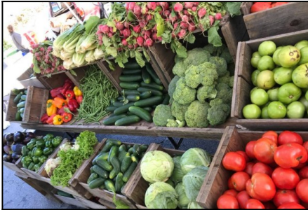
Farm fresh produce at Clasky Common!

Bags will be provided for the cleanup at the beach, 98 Manhattan Ave., according to a news release. Volunteers are asked to bring gloves, rakes and shovels.