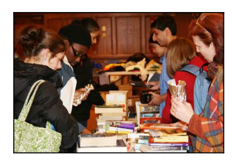
It's yard sale season! (http://blogs.trincol l.edu/)