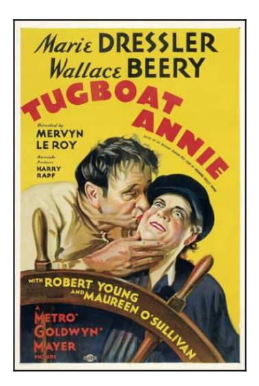
Watch the 1933 classic FREE in the theater of the Corson Maritime Learning Center.

Winter skies can often make for clear views of the stars. Take a walk to places with less light pollution allowing you to appreciate the natural beauty of our solar system and beyond. Free, registration required, to RSVP visit www.savebuzzardsbay.org//BayAdventures or email bayadventures@savebuzzardsbay.org. The Bogs 137 Acushnet Rd. Mattapoisett, Mass.