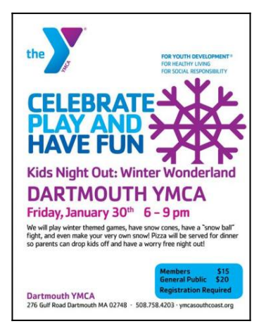
Kids been pent up inside because of snow? Bring them to Kid's Night Out!

Welcome to Painting with a Splash Where you are the artist! Painting with a Splash is the newest addition to Historic Whaling City Downtown New Bedford. Bringing you an experience of art as entertainment. Add a little wine (BYOB) that will surely tap into your creative side.