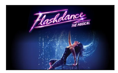
Don't miss Flashdance on Friday evening and Fancy Nancy Splendiferous Christmas, Saturday

Come visit the Buzzards Bay Coalition's restored Acushnet Sawmill on Saturday mornings in November and December. The Hawes Family Learning Center will be open from 9am-12pm. At 10am, join us for one of these hands-on family activities: Nov. 21: Trash Pick Up and Recycled Material Craft. 32 Mill Road, Acushnet.