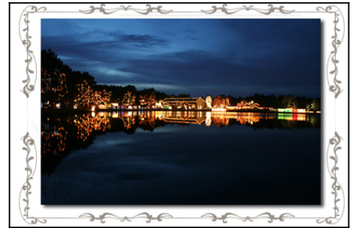
Festival of lights begins Friday!

Coast art scene. Wander the studio lofts of 88 Hatch Street and see where fine textiles, jewelry, ceramics, woodworking, paintings and drawings are made. Shop a wide variety of handmade gifts including ornaments, fine soaps and body products, jellies, honey, and children's toys. Rub elbows with enthusiasts' who come each year to add to their collections, browse, begin a collection or do some holiday shopping.