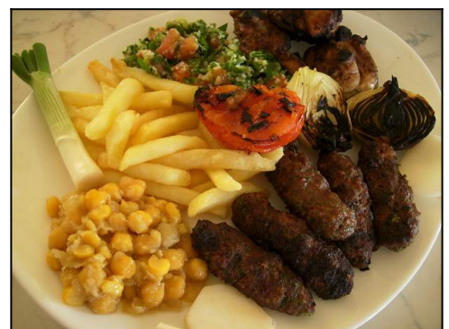
Lebanese Food! YUM!

Come and enjoy all your Lebanese food and pastry available to eat in or take out. Do your holiday shopping with local crafters who bring their best items to you. Take a chance on our beautifully made gift baskets. No admission. All welcome. Phone: 508.674.2036. St. Anthony of the Desert 300 Eastern Ave Fall River.