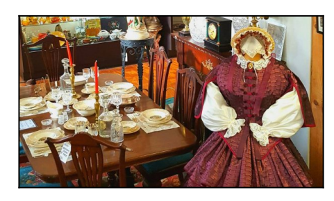
Find some local treasures at New Bedford Antiques at